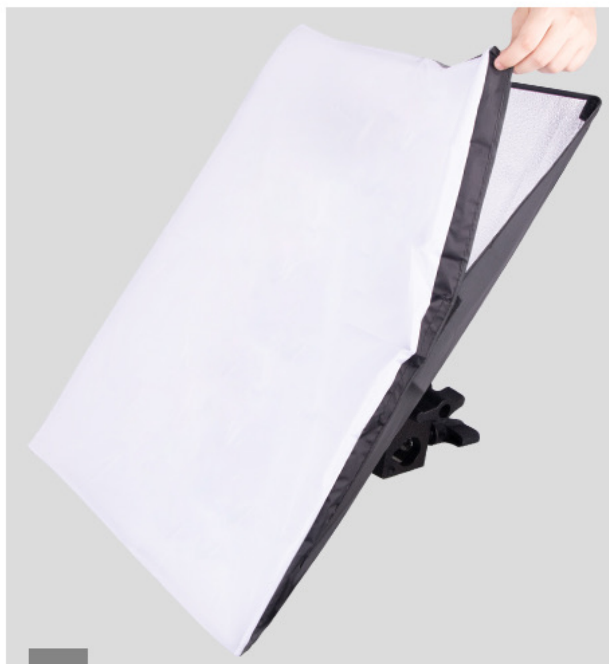
4 Set up the fabric cover