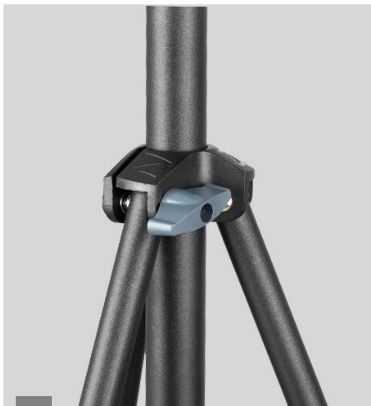
5 Open the tripod stand