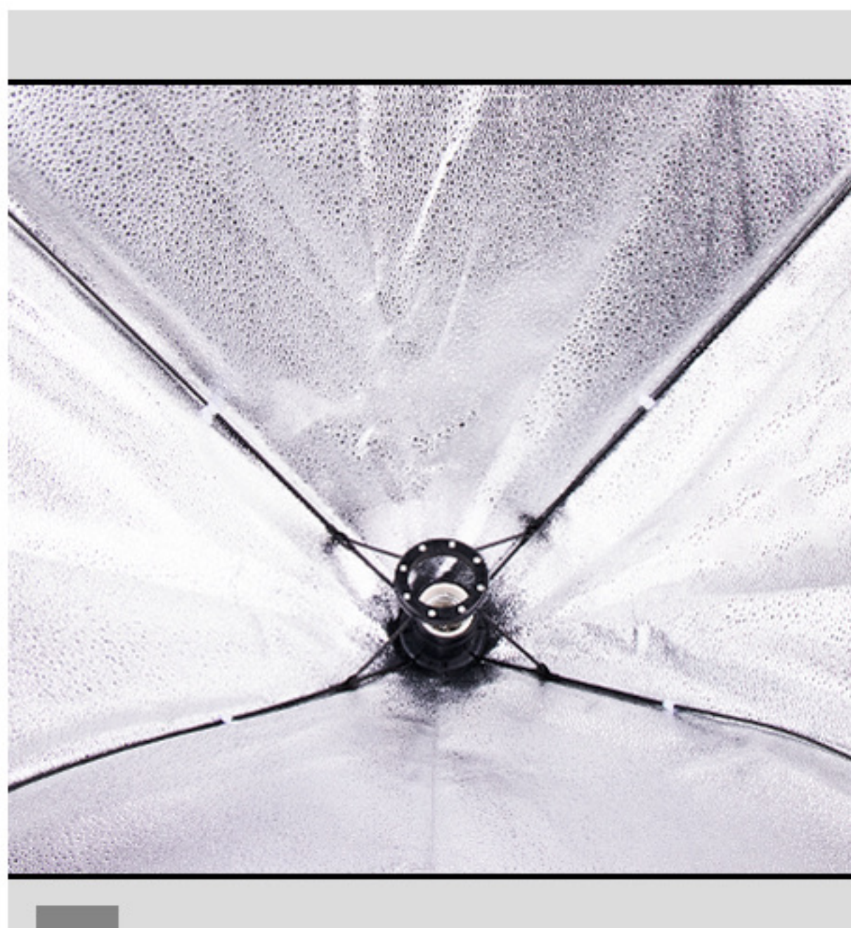
1 Open the softbox