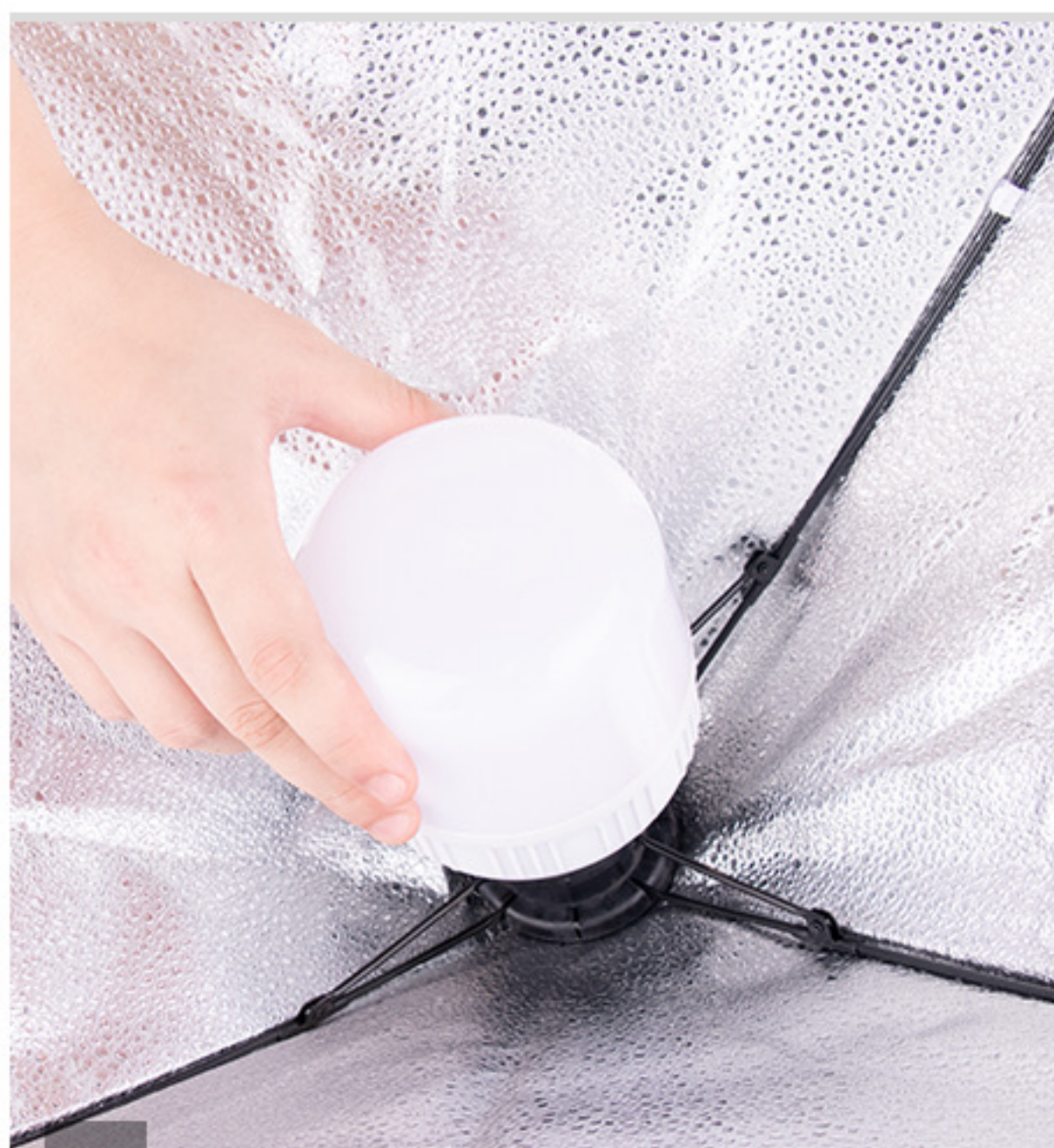
3 Install the lamp