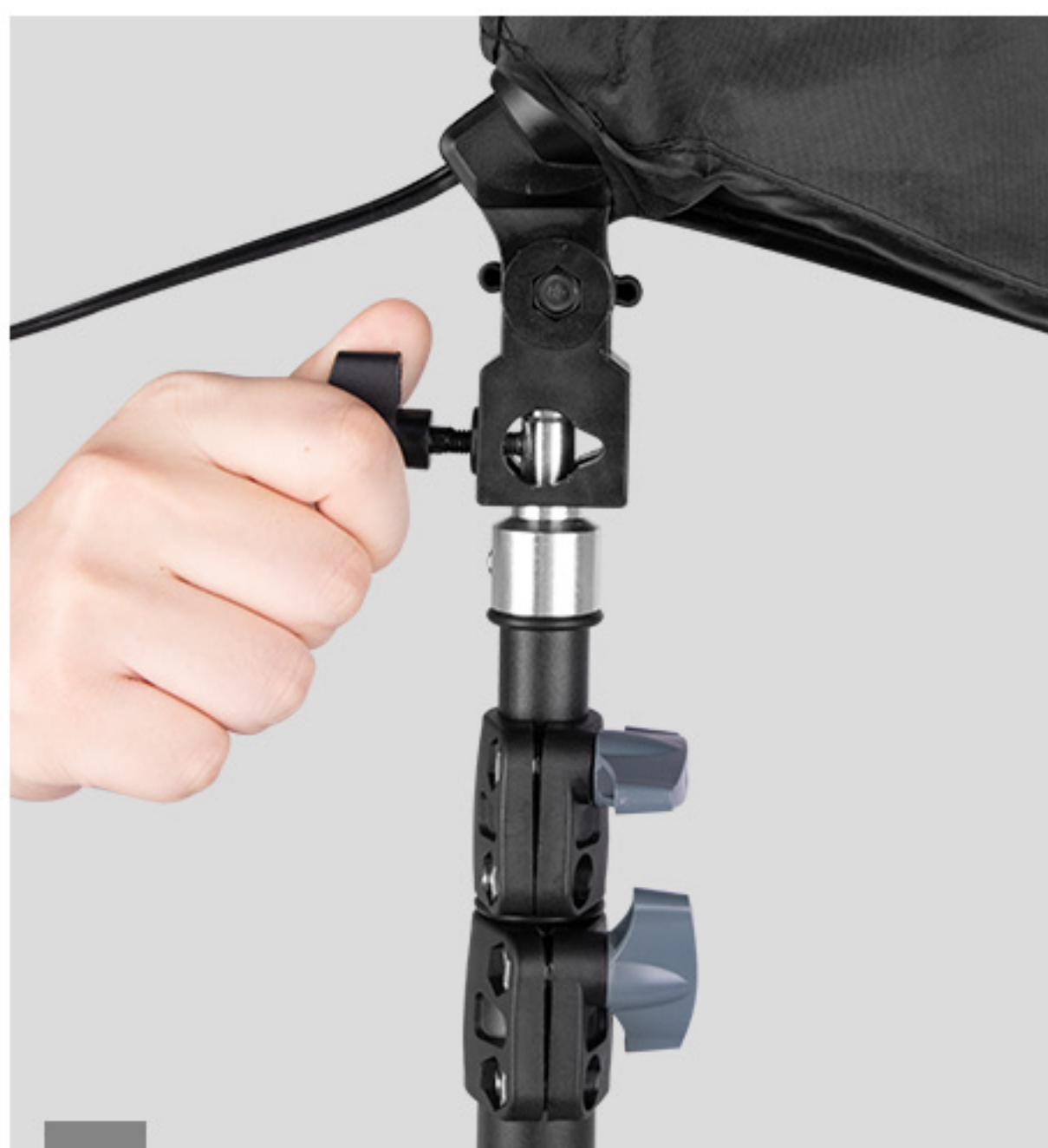
7 Attach the softbox to tripod stand