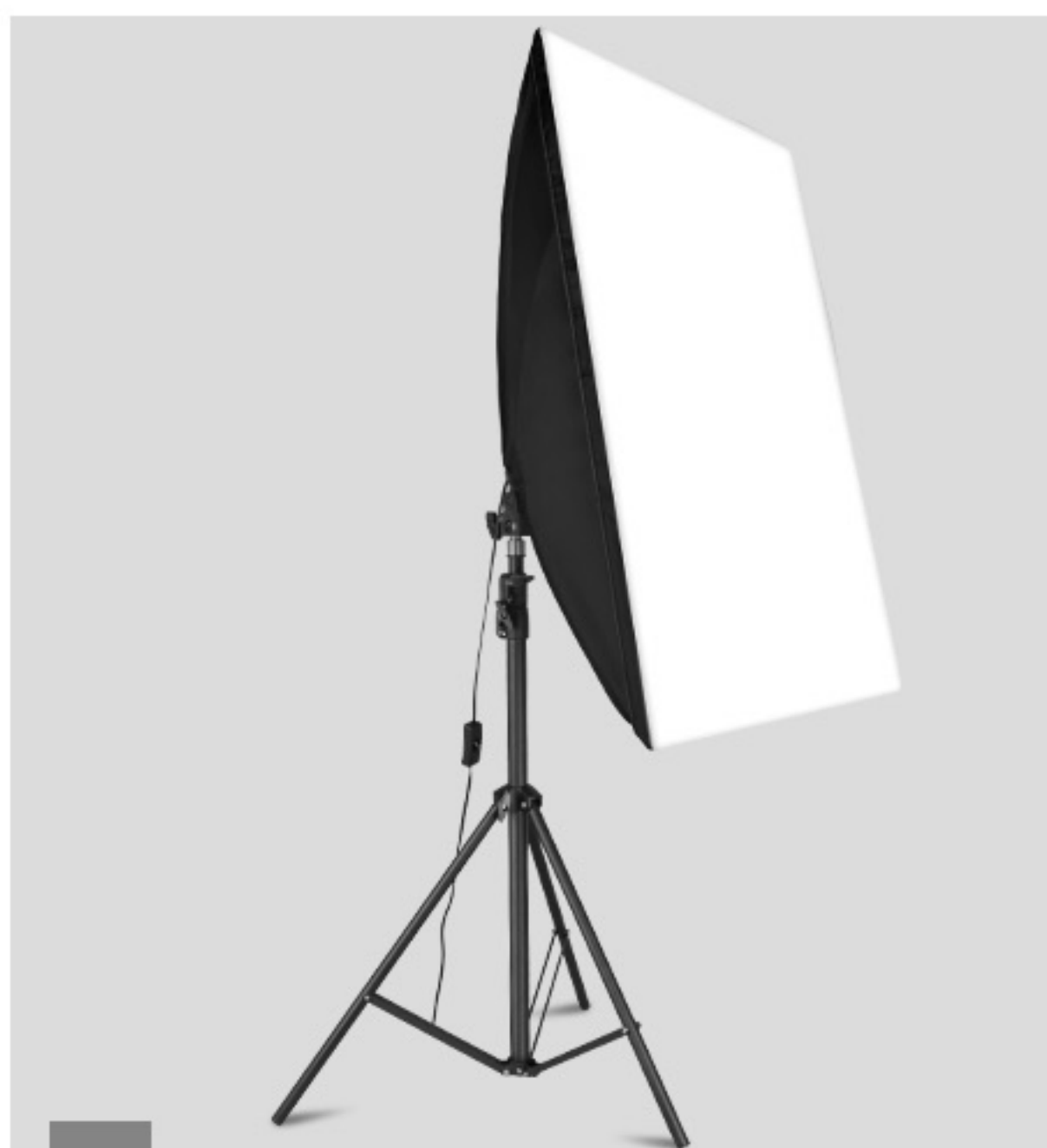
8 The installation is complete