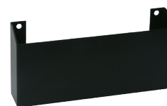
Wall holder for loop amplifier