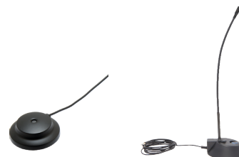
AVLM5 microphone for glass/wall