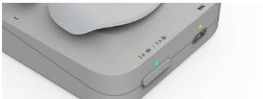
Figure 3: Red LED indicates heating / Blue LED indicates cooling