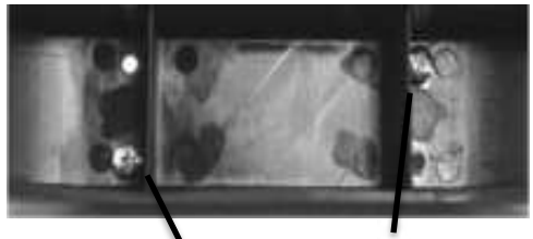
Screws in position once fitted to heater