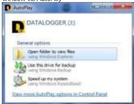
Window via AutoPlay