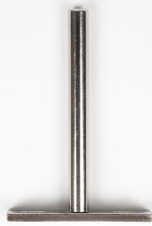
| T Brackets ×6