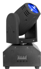
DMX Output 3-Pin XLR Socket