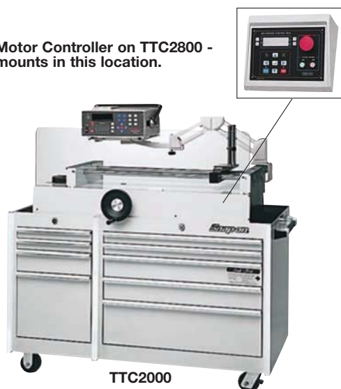
TTC2000 Basic System. Optional accessories on next page.

Motor Controller on TTC2800 - mounts in this location.