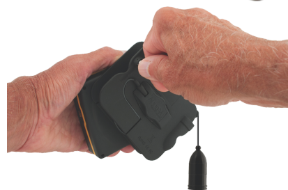
Adjustable Camera Clips and Trolling Fin for Viewing on Ice & Open Water