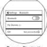
Turn on Bluetooth and search