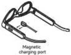
Magnetic charging port