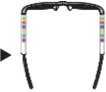
Dynamic lighting effects