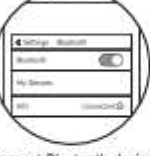
Connect Bluetooth device