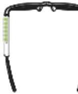
Static lighting effects