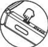
Control function keys