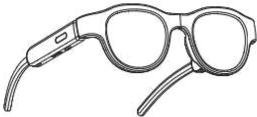
K01 Open-Frame Directional Audio Smart Glasses