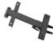
Cushion Bracket Frame 1 pc