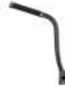
Left Large Handle 1 pc