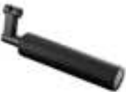
Foam Roller 1 pc