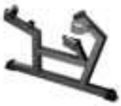
Right Main Frame 1 pc