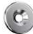
Roller Frame Cover 1 pc