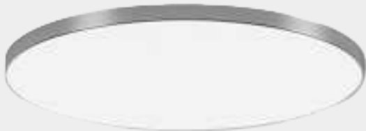
Morden Large Round LED Bedroom Ceiling Light