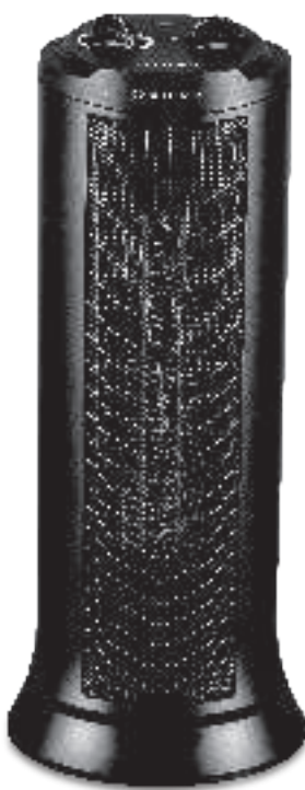
CERAMIC TOWER HEATER MODEL: HC-2017