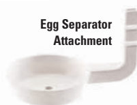
Egg Separator Attachment