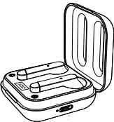
T100 Earbuds with Charging Case