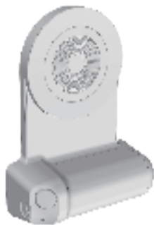
Camera handle camera bracket

Please read the manual carefully before use and keep it for future reference.