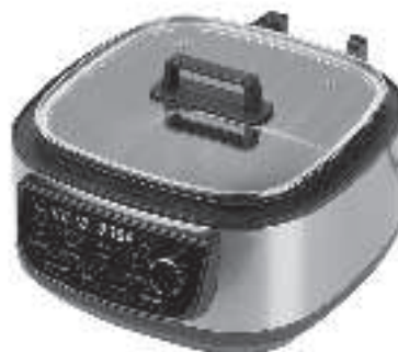
Using the Glass Lid