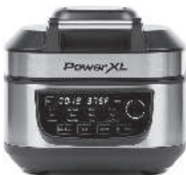
Model: MFC-AF-6 (6QT)