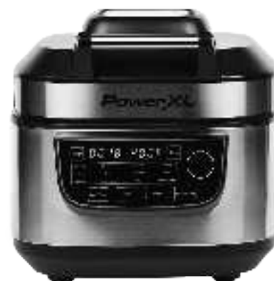
Model: MFC-AF-8 (8QT)