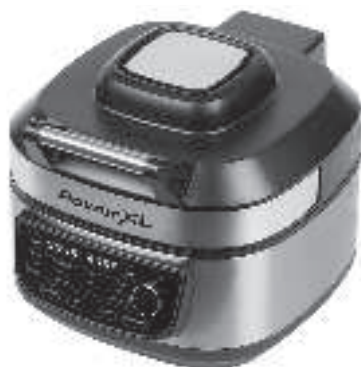
Using the Air Frying Lid