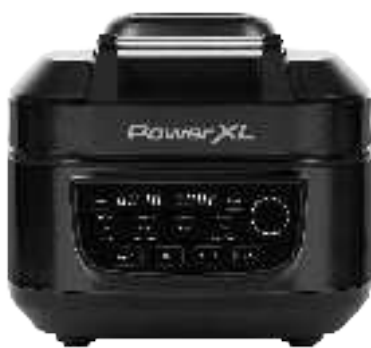
Model: MFC-AF-6C (6QT)