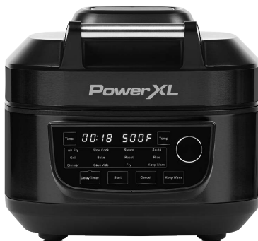
Model: MFC-AF-6C (6QT)