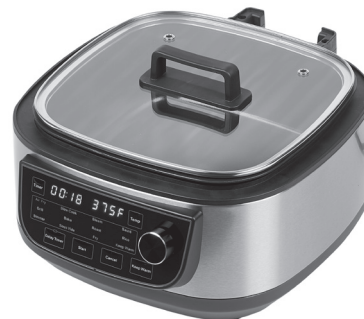
Using the Glass Lid