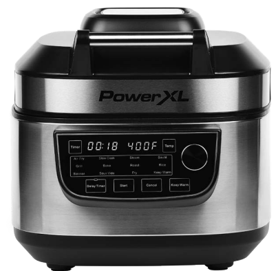
Model: MFC-AF-8 (8QT)