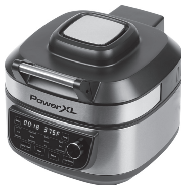
Using the Air Frying Lid