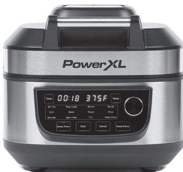
Model: MFC-AF-6 (6QT)