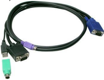
Special integrated USB & PS/2 KVM cable

Step 5. (Now your KVM switch or daisy-chained KVM Switches should have been powered-up and initialized....) Connect each of your computers to a computer port on the rear of the switch (es). You should use the special USB PS/2 KVM cable (with the USB-to-PS/2 adapter) for connection to a USB computer (PS/2 computer).