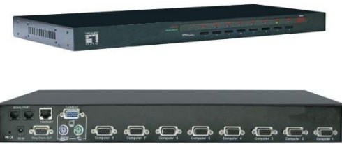
Português Diagrama de instalação