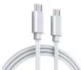
Double-end Type-C cable