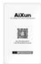
User manual card