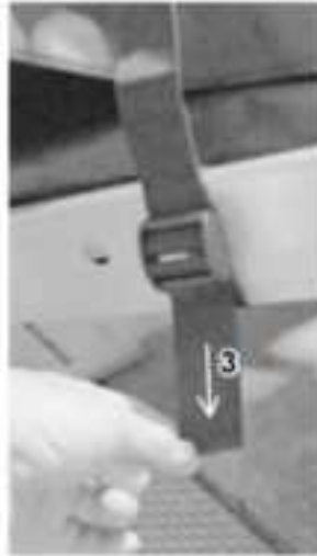
Pull down to tighten Strap

Now loop the end of strap underneath the buckle and through the middle slot of the buckle (see photo above left)