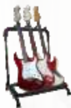
GRACK 3N1 OVAL