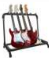
GRACK 5N1 OVAL