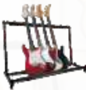
GRACK 7N1 OVAL