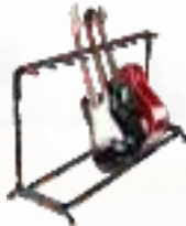
GRACK 9N1 OVAL