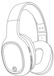
H2590BT MULTIFUNCTION WIRELESS HEADPHONE