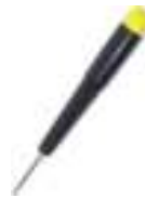
Screw Driver (1C016)