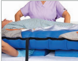
30° Body and Anchor Wedge System