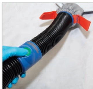
Point of Care Power Switch