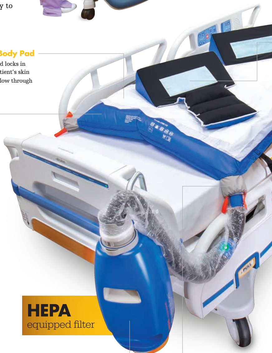
HEPA equipped filter