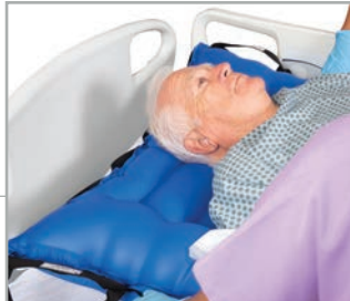
Integrated head support