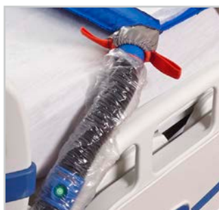
Hose Protection Sleeve