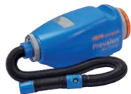
Prevalon Air Pump 120V 1/case Reorder #7455

30 pads/case (6 bags of 5) Reorder #7250