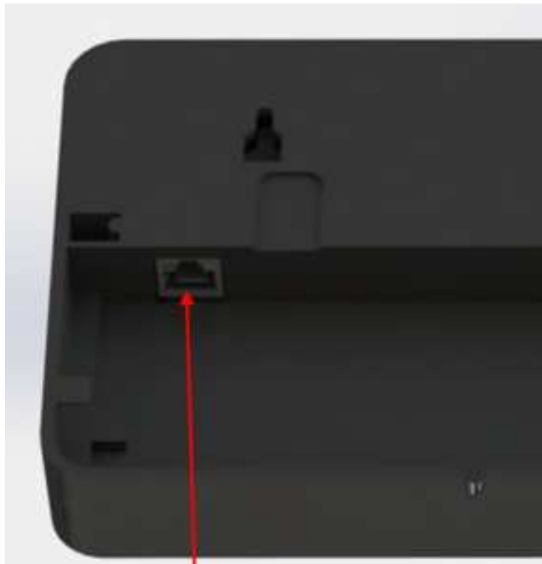
RJ45 connector (LAN/PoE)