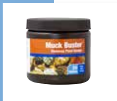
Muck Buster® #PB2682