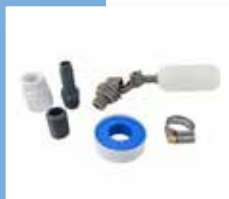
Auto Fill Kit #ABDAUTO