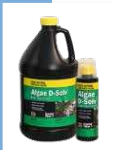
Algae D-Solv® #PB2002

If you need replacement parts please contact us directly at 888-619-3474 or email us at sales@bluethumbponds.com .