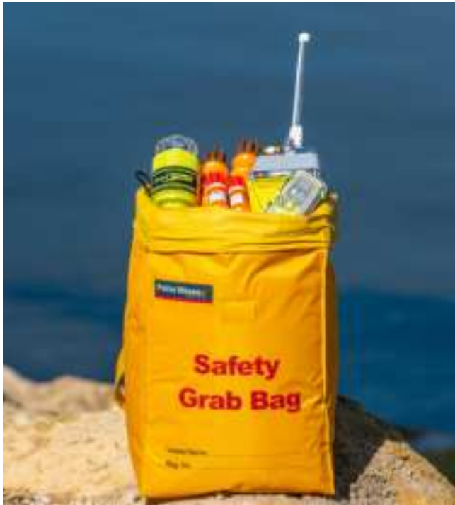
Safety equipment needs to be readily accessible.