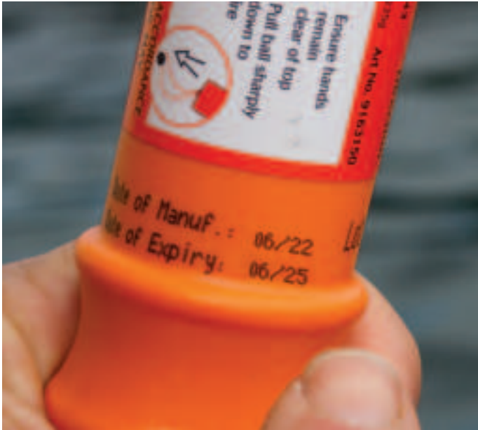
Flares need to be in date.

Flares must be within the expiry date and maintained in serviceable condition at all times. Check them regularly to ensure they have not been rendered unserviceable by exposure to moisture. Mildew or bubbling of paper coatings may indicate this.