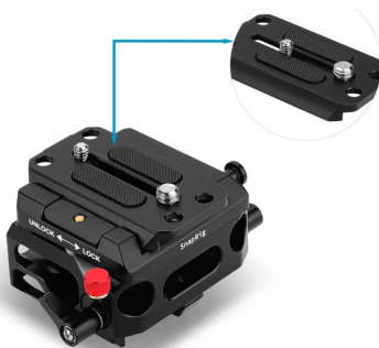
15mm Baseplate with Quick Release Plate

Please inspect the contents of your shipped package to ensure you have received everything that is listed below.