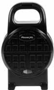
HRW6107: 5" DIAMETER