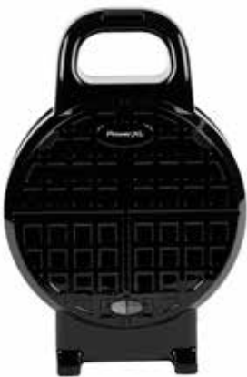
HRW6108: 7" DIAMETER