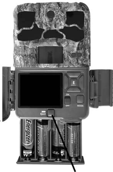
Battery Eject Button

Slide the battery tray into the closed position.