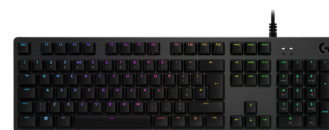
G512 MECHANICAL GAMING KEYBOARD