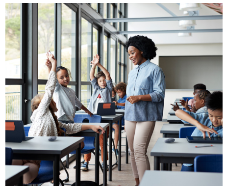
WHOLE CLASSROOM LEARNING

We have developed solutions to support these modalities, drive academic outcomes, and improve the social and emotional development of students. Our tools provide the flexibility to adapt to different environments and accommodate student and teacher choice.