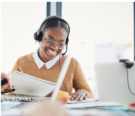
INDIVIDUAL LEARNING TIME

Our work with educators and students has helped define three distinct modalities: