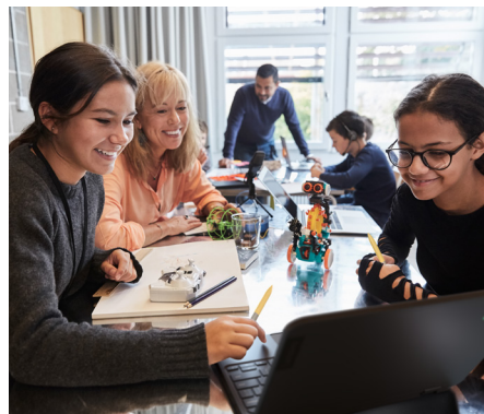
SMALL GROUP WORK