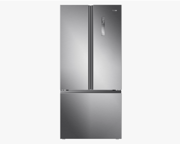
French Door Refrigerator Freezer, 79cm, 489L