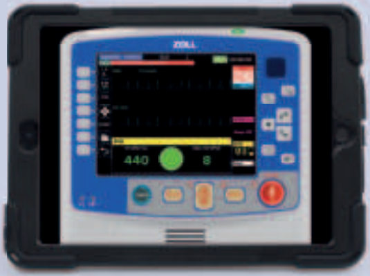
Training using SimConnect with any Manikin

Elevate Your REALTi 360 Experience: Intrigued by SimConnect's transformative potential? Get in touch with our team for a personal product demonstration.