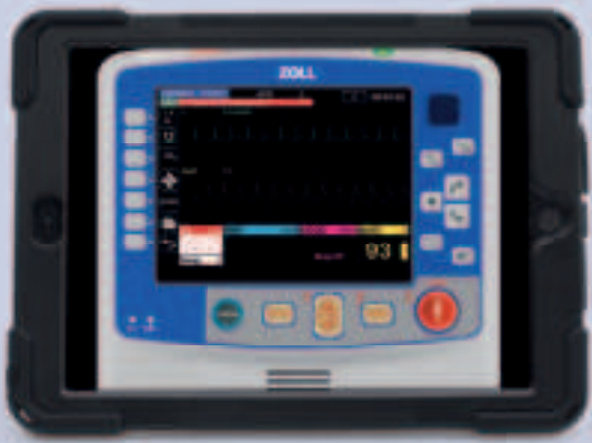
Training without SimConnect