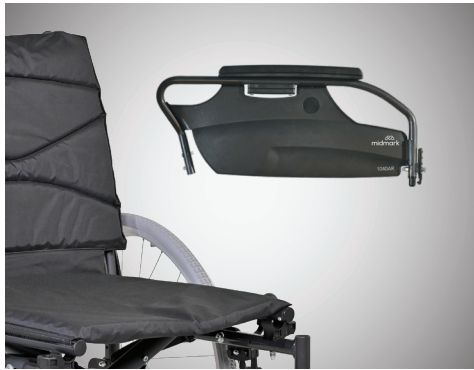
03 Swing-away and detachable armrests