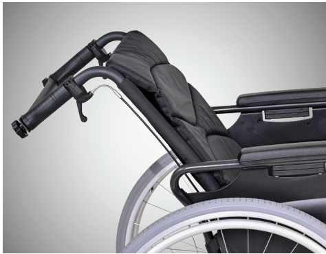
01 30° backrest inclination