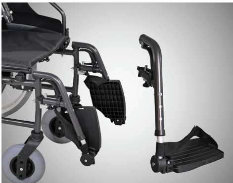
05 In and outwards swingable and detachable leg rest