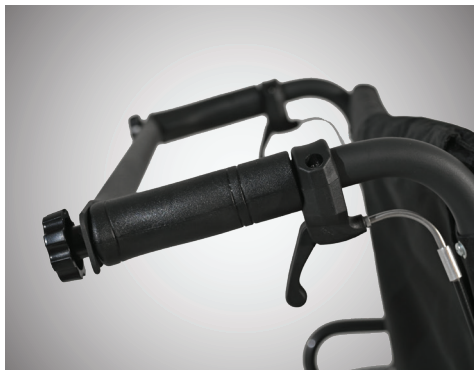
06 Push Handles