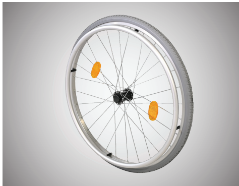
09 Integrated lowering of the rear axle