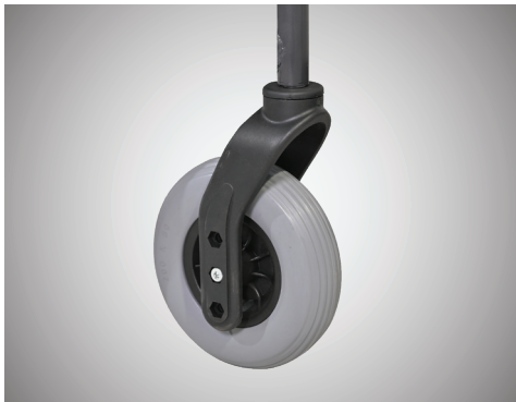
07 Front wheel