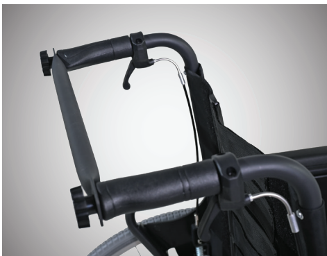
08 Metal push bar