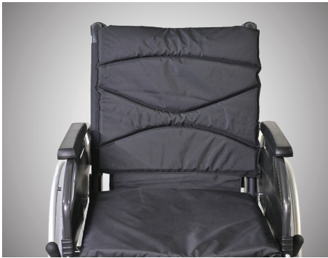
02 Padded nylon seat and backrest