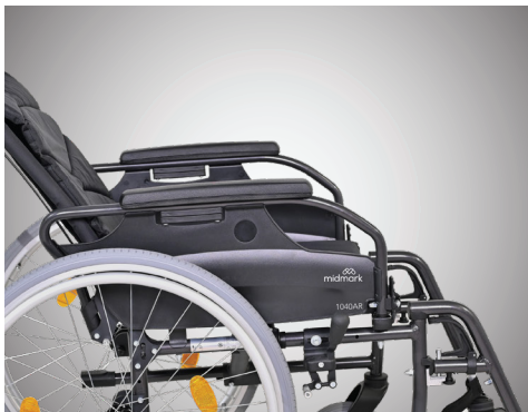
04 In height and depth adjustable arm pad