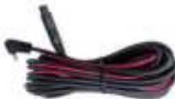
Rear camera cable