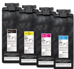
800 ml ink packs