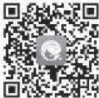
GREE+ App Download Linkage

Scan the QR code or search "GREE+" in the application market to download and install it. When "GREE+" App is installed, register the account and add the device to achieve long-distance control and LAN control of Gree smart home appliances.