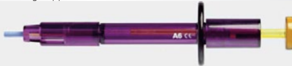
Single-use injector A6 with silicone tip

EN_32_022_00251 Single injector A6 is a reference of MDJ (CE 120). The contents of the brochure may differ from the current status of approval of the product in your country. Please contact our regional representative for more information. Subject to change in design and scope of delivery and as a result of ongoing technical development. Printed on elemental chlorine-free bleached paper. © 2015 by Carl Zeiss Meditec AG. All copyrights reserved.