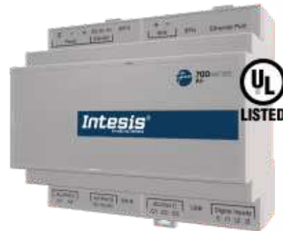
Fujitsu to Modbus TCP/RTU - Up to 64 Indoor Units

The Fujitsu application has been specially designed to allow bidirectional control and monitoring of Fujitsu VRF systems from a BMS, SCADA, PLC, or any other device working as a Modbus client. The solution allows the integration of up to 64 indoor units from a single interface.