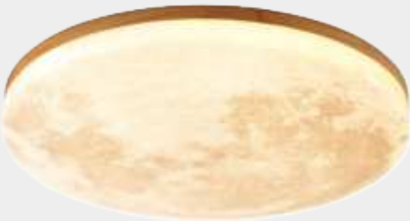
Simple Minimalist Moon Round LED Ceiling Light