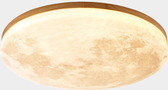
Simple Minimalist Moon Round LED Ceiling Light