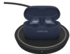
Jabra Elite Active 75t Wireless Charging -