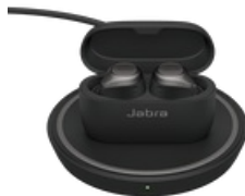
Jabra Elite 75t Wireless Charging -