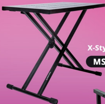
X-Style Utility Table