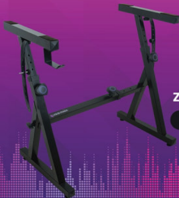
Z-Style Keyboard Stand