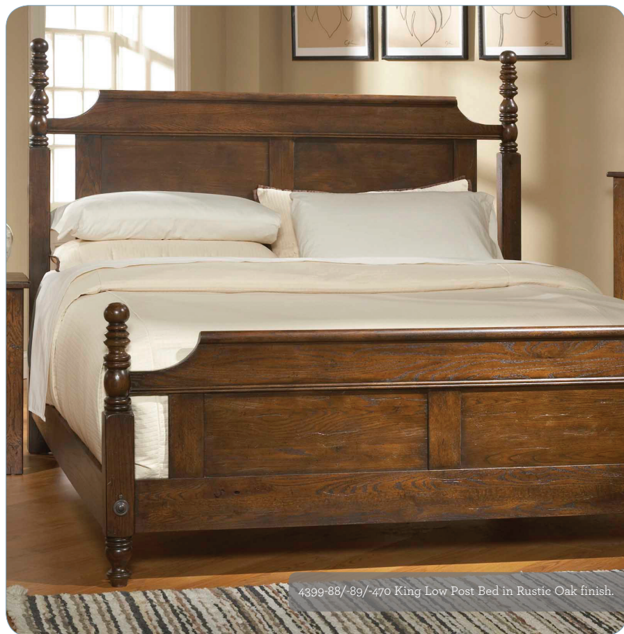
4399-88/-89/-470 King Low Post Bed in Rustic Oak finish.