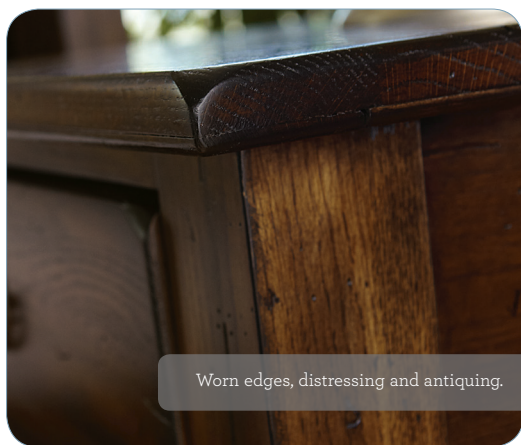
Worn edges, distressing and antiquing.