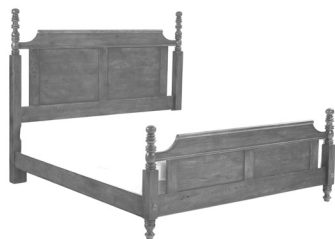
Low Post Bed