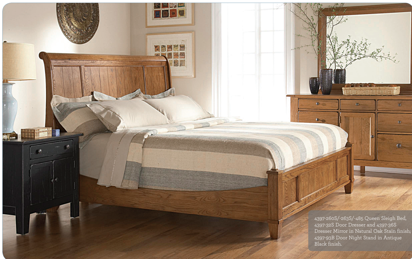
4397-260S/-263S/-485 Queen Sleigh Bed, 4397-32S Door Dresser and 4397-36S Dresser Mirror in Natural Oak Stain finish; 4397-93B Door Night Stand in Antique Black finish.