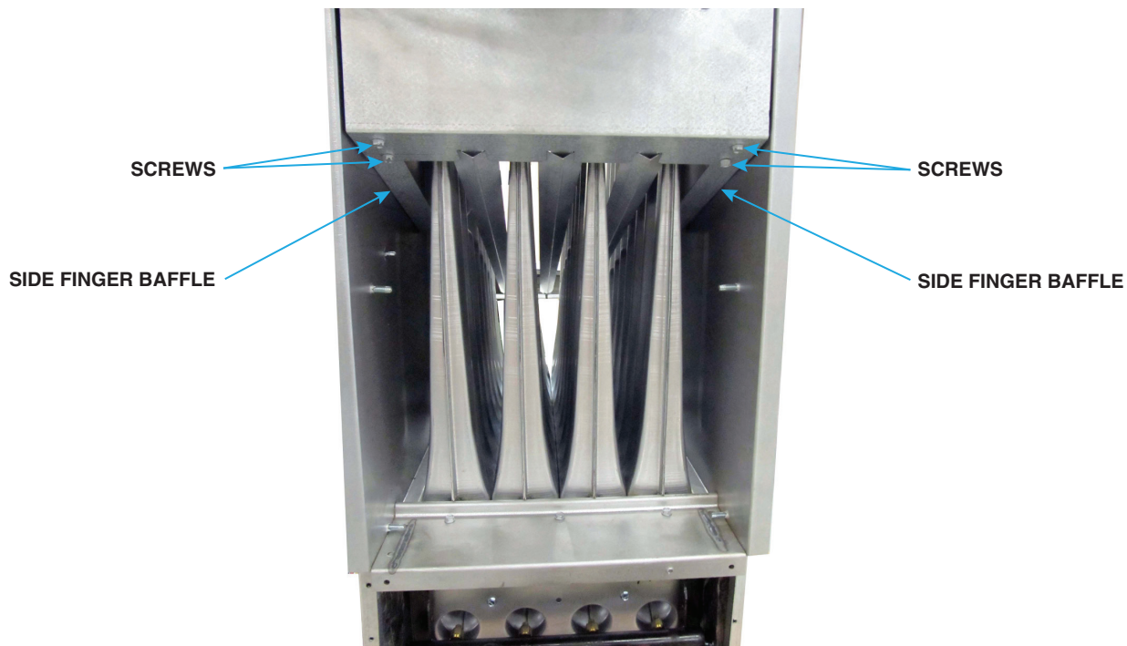
Figure 3. Side Finger Baffle Removal

5. Install field conversion label (see Figure 4 ):