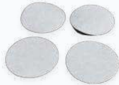
4x Double Sided Adhesive