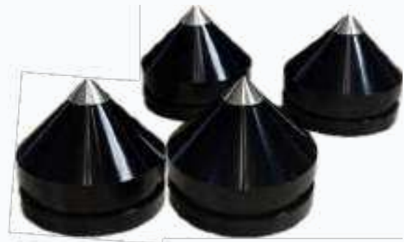
4x Spike Feet