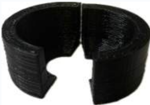
4x Install Tool