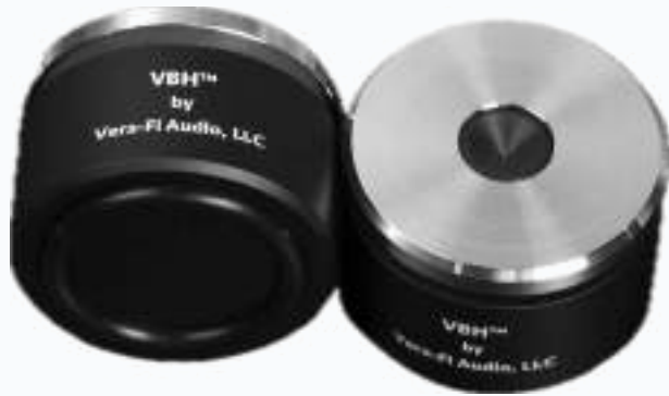
4x VBH Base

Before assembly, ensure that all the following items have been included with your Vibration Black Hole - Standard Spikes. If anything is missing, please contact us at sales@veraflaudiollc.com