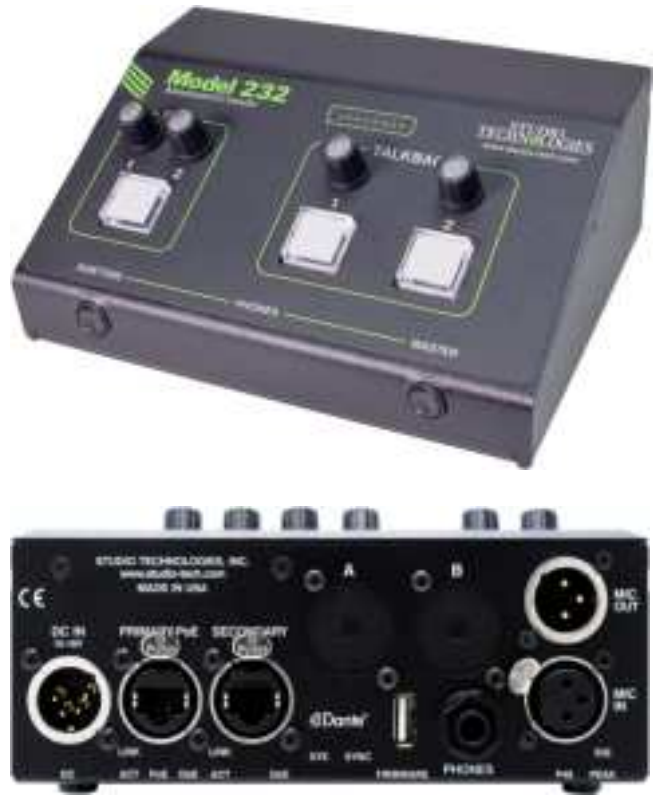
Figure 1. Model 232 Announcer's Console front and back views

The Model 232 was designed to meet two main goals: supporting great audio quality and providing an extensive set of configurable features. Using the latest in audio integrated circuits and advanced 32-bit audio processing, the unit's audio performance should meet or exceed that of any audio console, standalone microphone preamplifier, remote I/O interface, or outboard A/D or D/A converter. With over 40 years of professional audio experience, Studio Technologies takes audio performance seriously! And while providing excellent technical specifications is a "must," a device also has to "sound" good before we feel its design is complete.