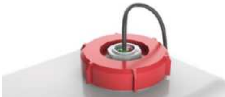
Fig.3-5 Fix back cover of service open