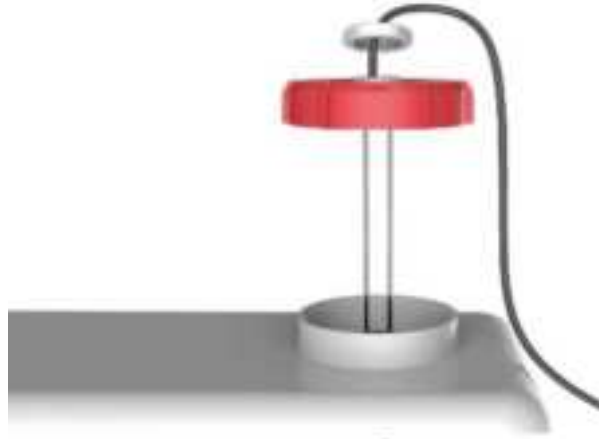
Fig.3-3 Pass screw cap of RSE-A through the cable