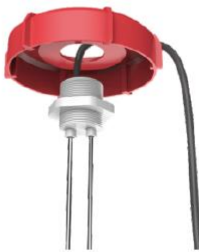
Fig.3-2 Pass RSE-A through the hole on service open