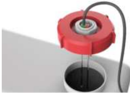
Fig.3-4 Fix screw cap with thread body