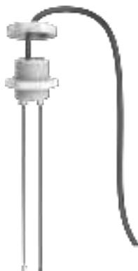
Fig.2-1 Product outlook