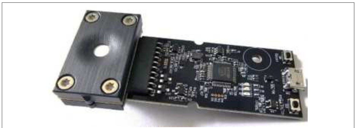
Figure 2: TCS3448 EVM (daughter board with optical stack connected to the FTDI controller board)